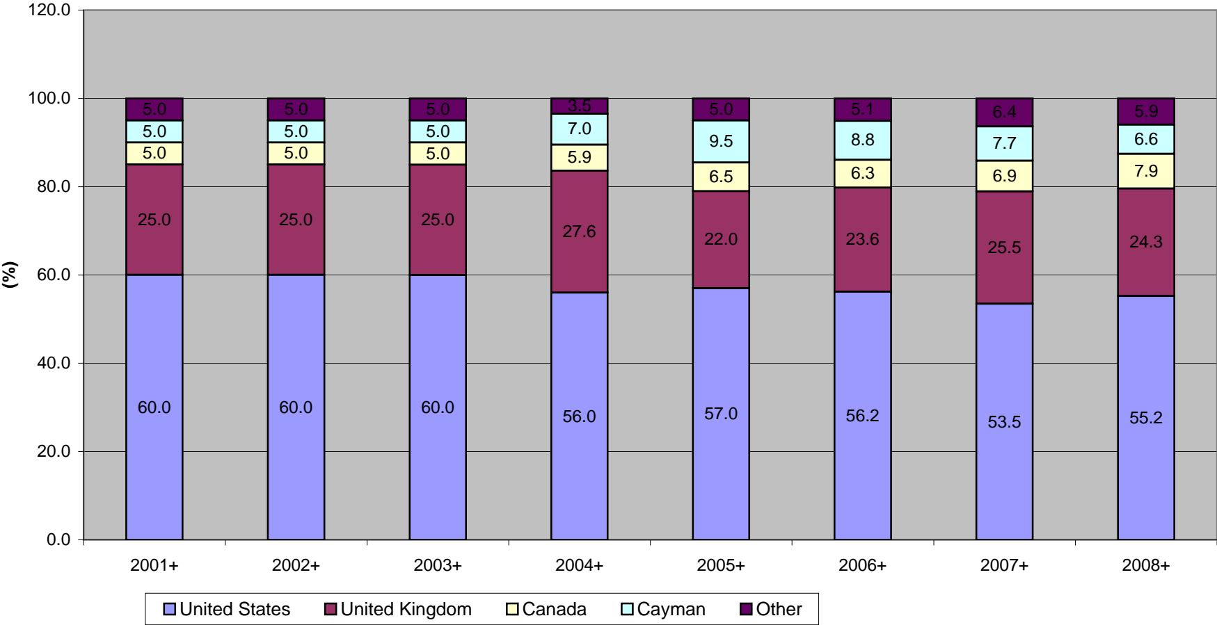
Chart 2: Percentage Contribution by Source Country