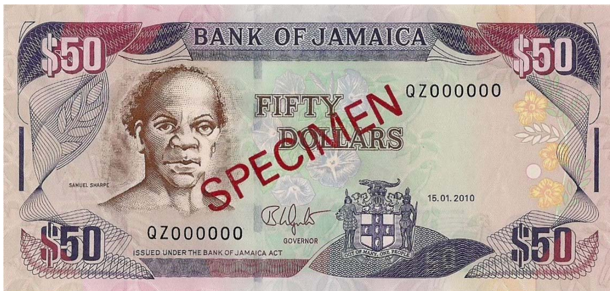
Front of older version $50 Banknote